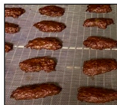
Figure 1. Raw pet food (a,b) and dehydrated pet treats (c,d) containing 75% beef liver (BL) and 25% beef heart (BH) and either 1× (1% sodium alginate + 0.85% encapsulated calcium lactate) or 0.5× (0.5% sodium alginate + 0.425% encapsulated calcium lactate) ALGIN exhibit visible differences in three-dimensional structure.