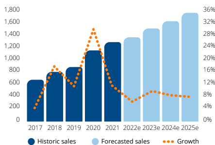
Mood and mental health supplement sales and growth, 2017–2025e